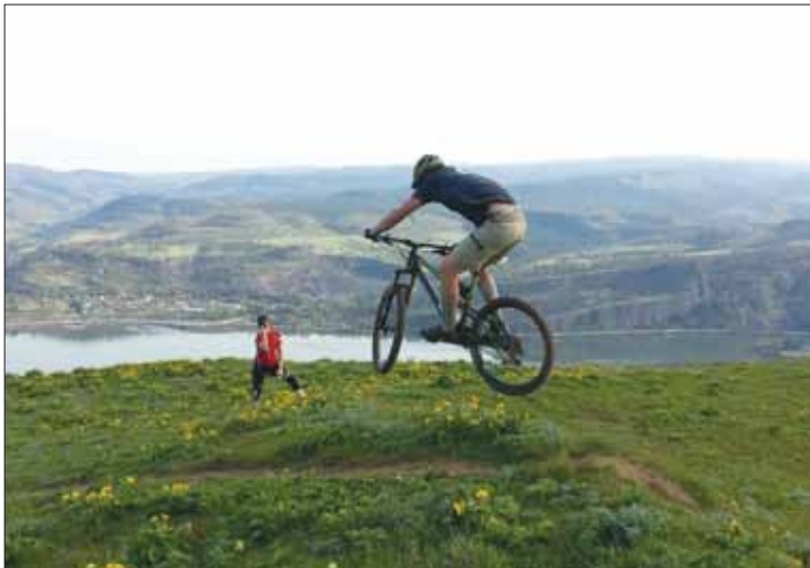
Getting some air time with the Columbia River in the background.