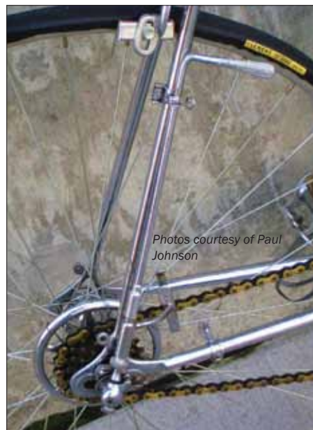
e. Single lever Campagnolo Paris-Roubaix. Not for the faint of heart.

The '60s brought us Campagnolo's Gran Sport (f) and Nuovo Record derailleurs. Popular for decades due to their smooth shifts, good durability and lighter weight, these beautiful derailleurs have become icons in our sport. It's easy to see these were hits, as typing "Campy derailleur tattoo" into an image search engine will yield lots of results. Reliable shifting systems like these also meant that road bicycles became known as "10-speeds" in popular