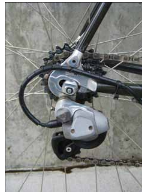
h. The electronic activated 1994 Mavic Zap.

Mavic unveiled the first commercially viable electronic derailleur in the '90s with its Zap system. The Zap derailleur (h) received signals from battery-powered buttons on the handlebars, but the spinning upper derailleur pulley generated the juice to move the chain. When Zap worked, it worked perfectly. Unfortunately, it wasn't protected from water and vibration all that well. Today's electronic shifting builds upon Mavic's foundation. Shimano's Di2 and Campagnolo's EPS derailleurs add