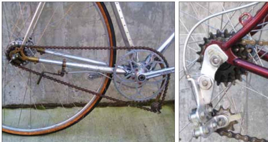
b. The 1930s Constrictor Osgear Super Champion.