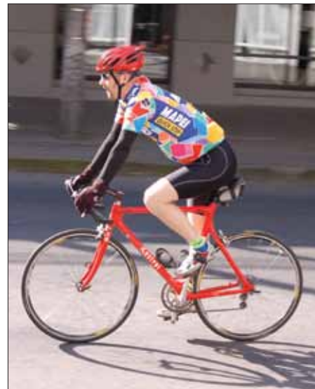
Some prefer a kit even for short commutes.

"In my opinion, the more people bicycling the better!" Fisher says. "Bike share programs make the city more accessible for more people and remind them that it's not too much work after all!"