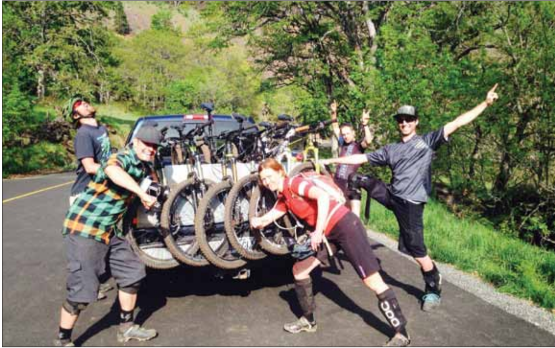
A truck can come in handy for shuttling large groups of riders and their bikes. The payoff is getting to check out the views on the way up and having fresh legs for the miles to come.