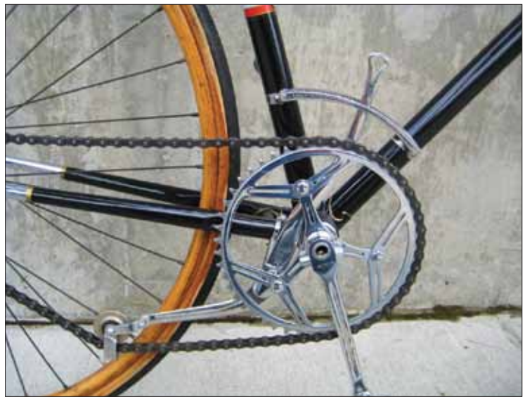
A. The Vittoria Margherita: a simple and elegant style.

These days, modern engineering greets us every time we walk into a local bike shop. Steel tubing is a rare sight compared with the amount of carbon fiber littered about the showroom floor. Many bikes now utilize hydraulic fluid to activate disc brakes and modern suspension keeps the tires on the trail. Once clunky mechanical contraptions, derailleurs are now sleek and smooth, some with battery-operated electronics controlling the action. Nowadays you can get a couple dozen gear choices all operated by push buttons. Ever wonder how we arrived at this point? Let's take a look at the technological progression bicycle derailleurs have made over the decades.