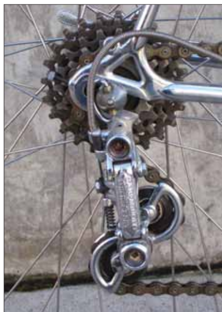
f. Campagnolo's Gran Sport offered reliable shifting.

modern bike, it is understandable that these mechanisms required quite a bit of finesse to operate.