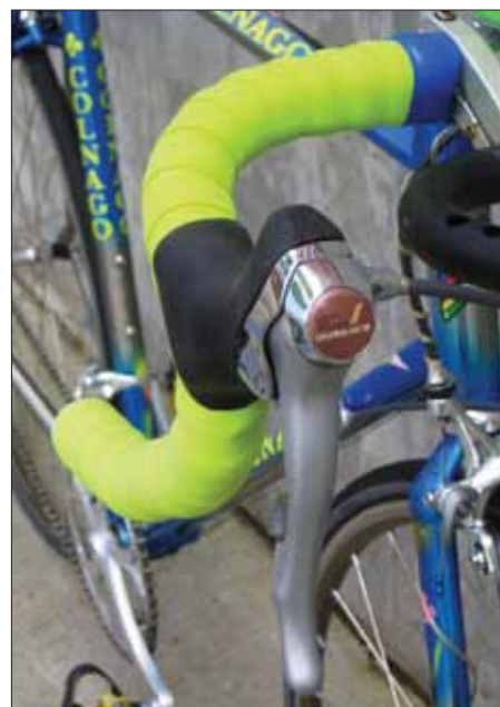
g. Dura-Ace STI levers.

vernacular during the '60s and '70s as gear capacity expanded.