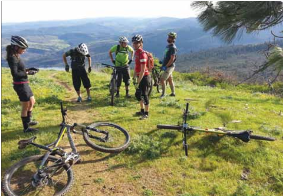
The group takes a break and shares a few precious moments before bombing the downhill.

over to Hidden Canyon to ride tasty, techy singletrack to the bottom. This seems to be the popular route, or the "enduro" thing to do. We were there to ride our big bikes, so we had two cars. We also wanted a sunset glory ride to finish the day after riding Post Canyon in the morning.