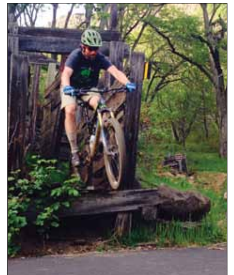
An opportunity for air may come in unlikely places.

it. I learned that before heading out to ride in this area, one should first apply Technu or sunscreen to exposed skin, as just barley rubbing up to this plant will be enough to get oaked. Wear tall socks, knee warmers and long sleeves. Also, try not to fall in the lush green vegetation during the ride, and when taking photos, look before frolicking along the trailside. Soon after finishing, change clothes, put them in a bag, then apply another round of Technu. Most importantly, drive straight home and shower immediately: don't drive straight to White Salmon, eat an amazing XXX-size burger with peanut butter and pickles, drink a few beers, drive back to Bend and go to bed without showering.