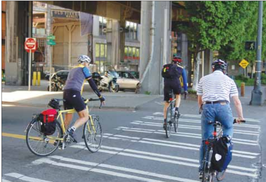
Bike commuters can be seen wearing all kinds of clothes. Do drivers or other cyclists care?

tive on personality and the type of riders: "The more bikes on the road the better; the more the merrier. My friend who works in tech is super modern and likes riding really fast on his titanium bike. It suits him. Bike messengers who wear studs and the chain — whatever that look is — that's just their style, and this is my style, casual and fun."