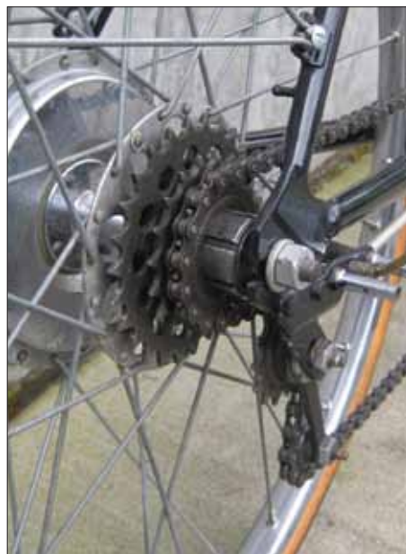
d. Trivelox shifters moved the cogs and kept the derailleur in a fixed position.

two levers managing this action and care had to be taken not to lose the wheel out of the dropouts. The later Paris-Roubaix (e) version operated everything with a single lever and some refinements made this system slightly safer. In both of these examples, long serrated dropouts would keep the rear wheel aligned while the shift was being completed and rearward force on the wheel would keep the chain tensioned. To anyone who has dropped a chain while shifting their