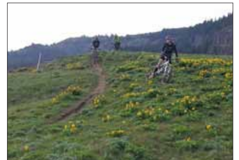
Singletrack and greenery equals perfection.

So it turns out that I did get poison oak that day. I spent the next three weeks itching, scratching and spreading the horrible oil all over my body, but it was well worth