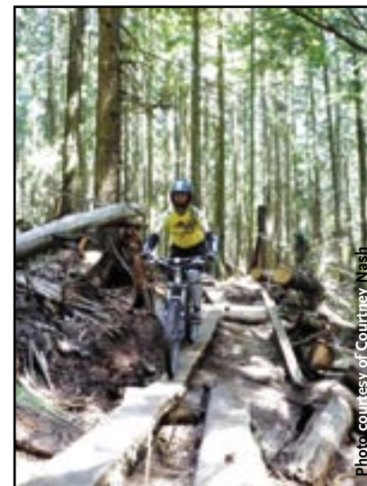
Once you master riding a straight line on the ground, move to a low elevation structure like a plank.

Learning how to ride straight lines will help other aspects of your riding as well: looking