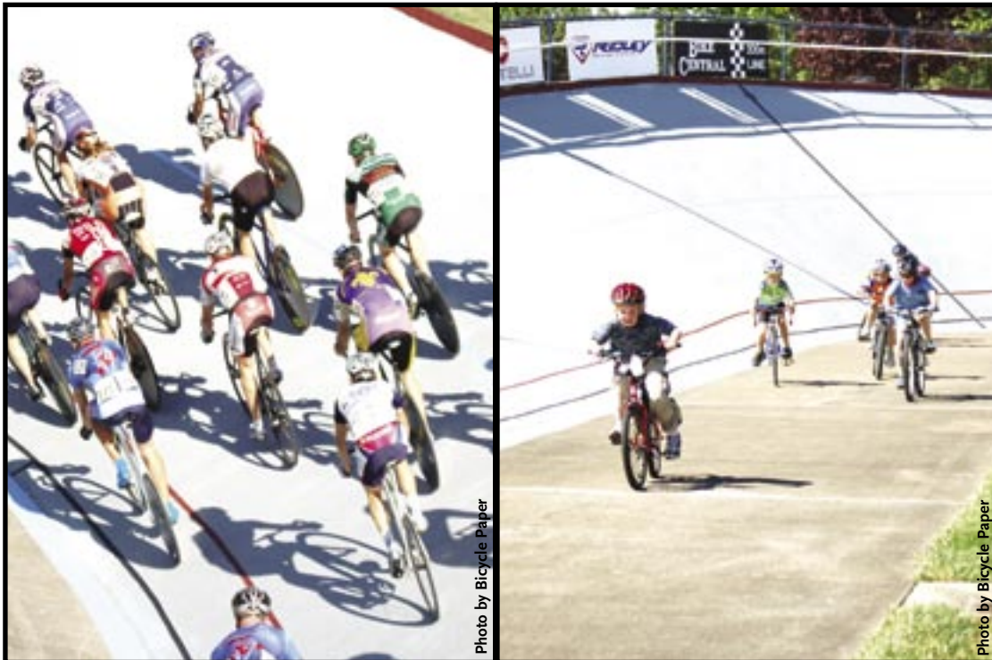
These Kiddie Kilo participants (right) demonstrated as much enthusiasm and were as eager to race as the “real” racers. They are the stars of the future.