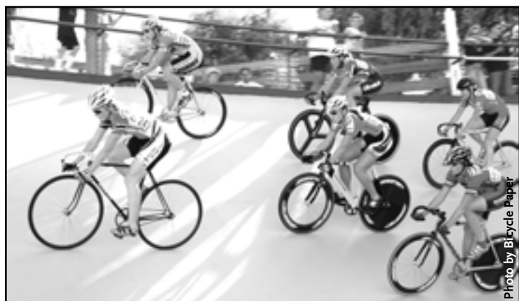
The action packed women's Scratch race got the crowd going.