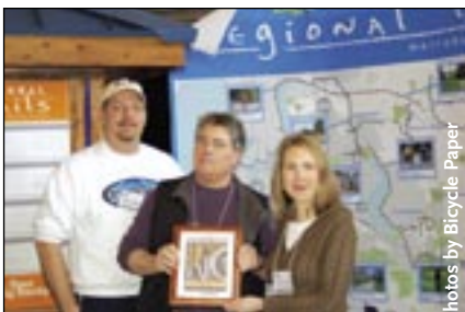
Top to bottom - Phil's South Side Cyclery, Full Speed Ahead, King County Park/Group Health.