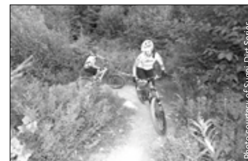
Learning to shift your body weight will help your cornering abilities.

There are heaps of other tips I could provide on dialing in a tight slow-speed switchback