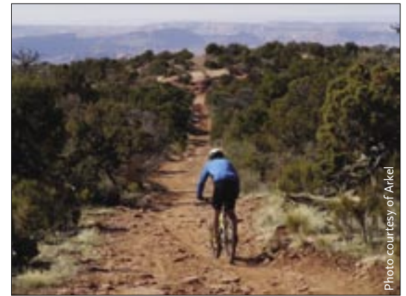
The tranquility and beauty of off-road riding.

Ketchum, ID. See July 3-7 for description. Also available: August 14, August 21, and August 28. Western Spirit Cycling, www.westernspirit.com