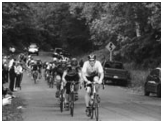
Stretching the pack on Mud Mountain!