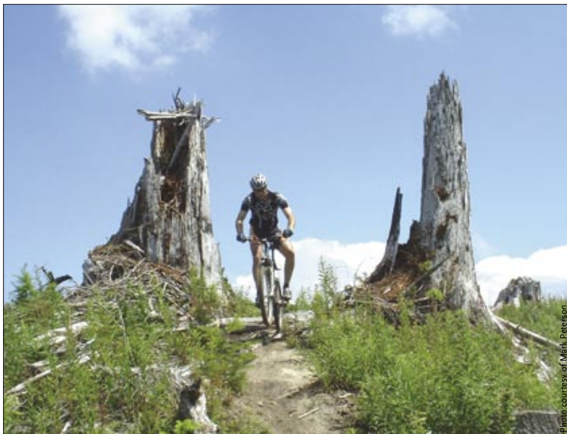
To reach Wonderland, the highest point of Galbraith, riders must follow fine singletrack trails.