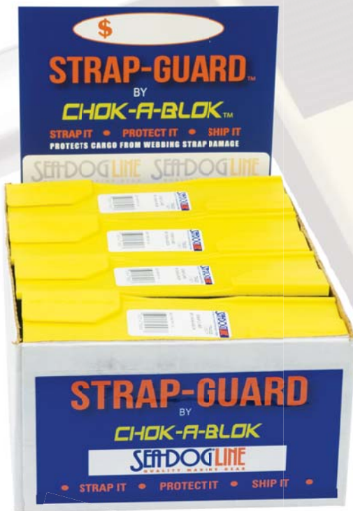
756020 BOX OF 20

Suggested retail selling price for the packaged version is $10.99 each, and $9.99 for the bulk version. Contact Sea-Dog or your local distributor for information regarding availability and further details.