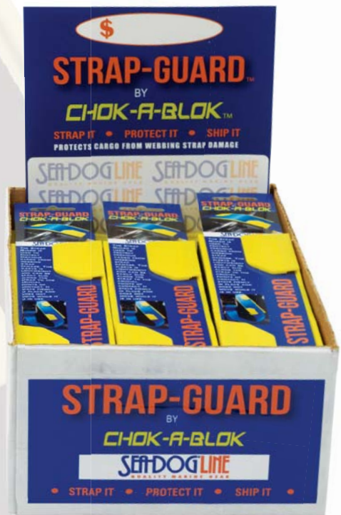
756020-1 BOX OF 15